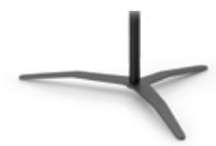
TB travel base