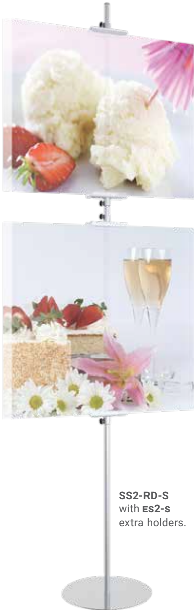
SS2-RD-S with ES2-S extra holders.