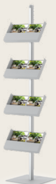
YLS4-C-S Single Sided Catalog Stand (4)