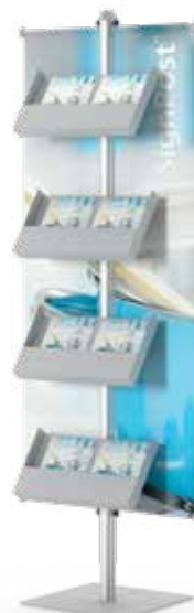
With Banner Stand