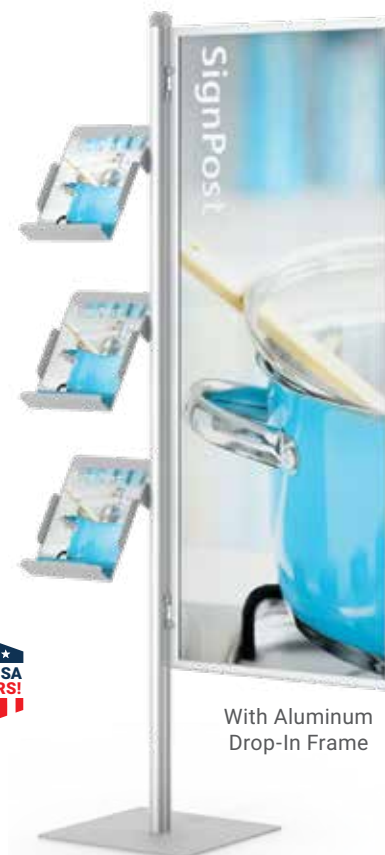
Y1PD90F-S with (3) CRLSLM