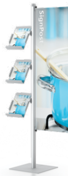
YB1618-S with (3) CRLSLM-S