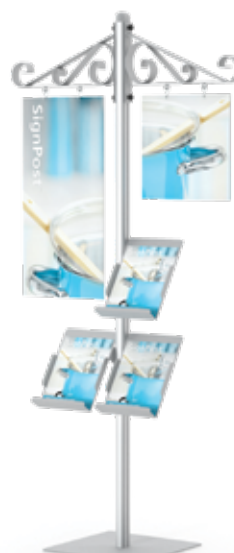
Lit. Holders & Scroll Brackets