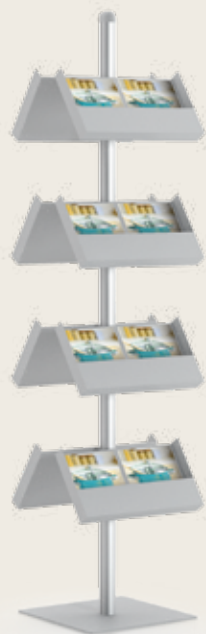
YLS8-C-S Double Facing Catalog Stand (8)