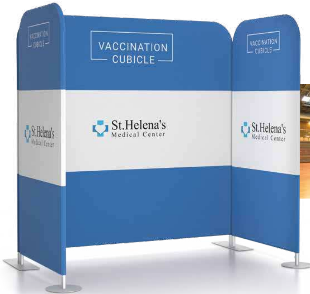
PW353 w/GFX-PW353-D | Stand with double sided pillowcase graphic