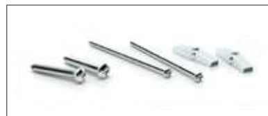
Plaster & wood ceiling hardware

Designed to be used with plaster, wood or suspended grid ceilings